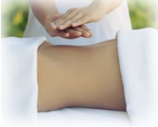
Reiki healing treatment - joanelson.net